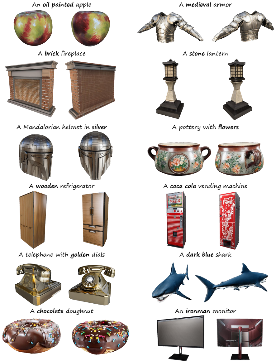
Fig. 10: More texture generation results of our proposed method.