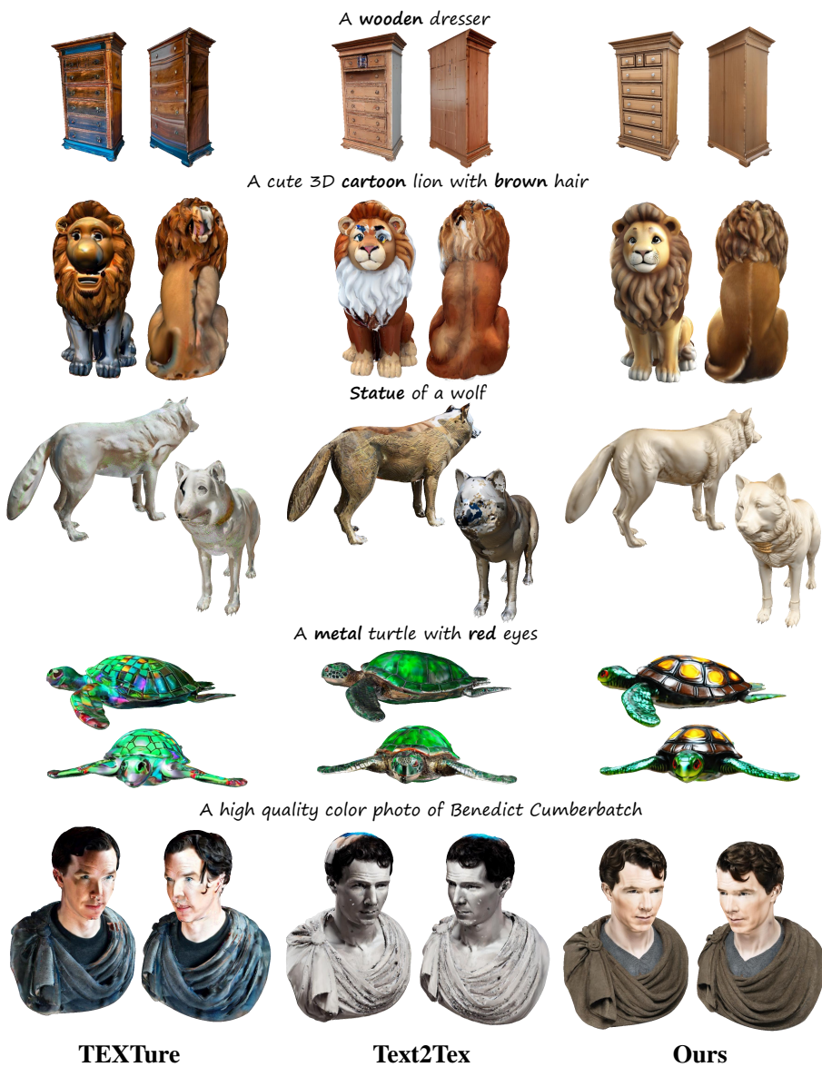
Fig. 11: Visual comparison of our proposed method against TEXTure [5] and Text2Tex [1].