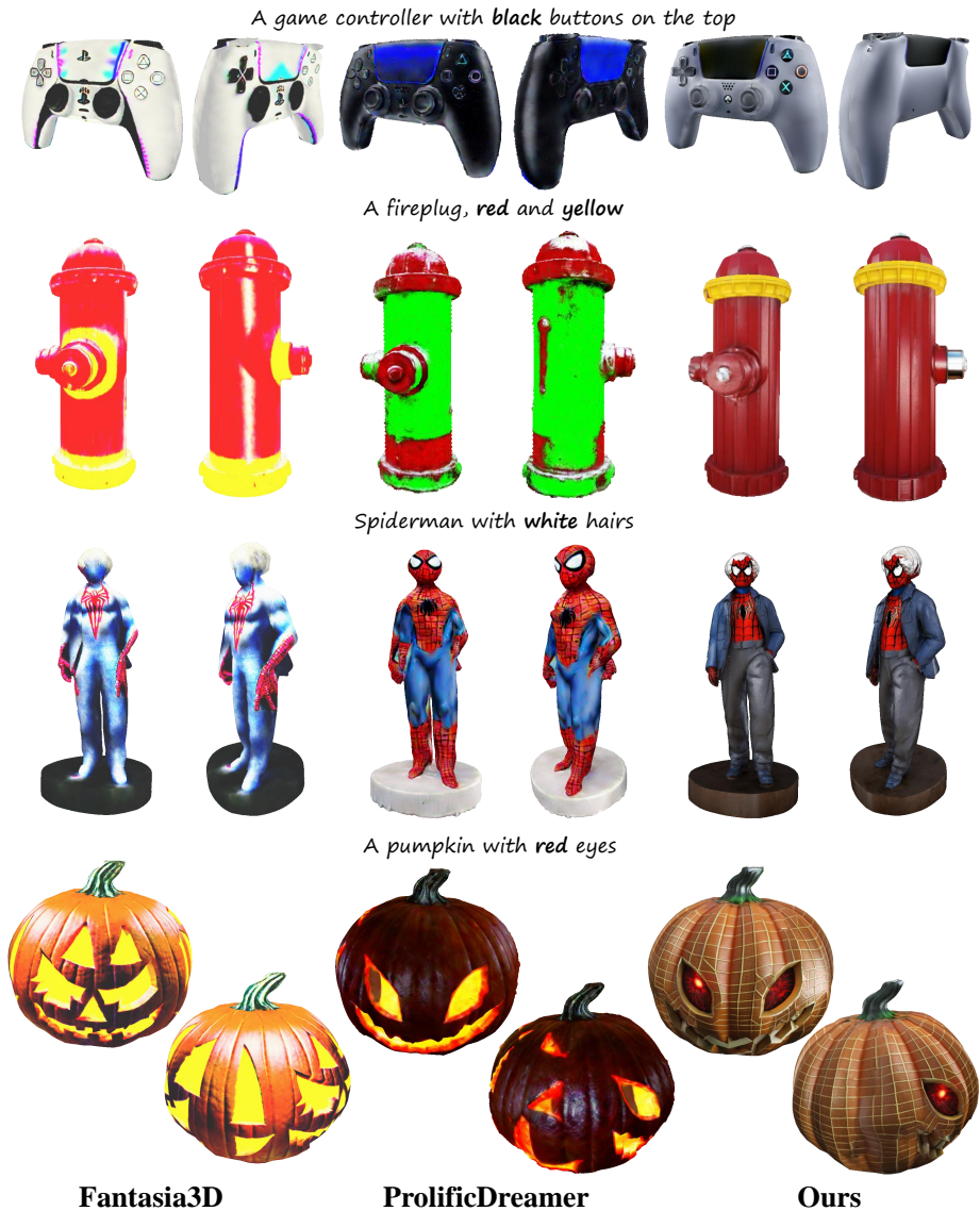
Fig. 12: Visual comparison of our proposed method against Fantasia3D [2] and ProlificDreamer [6].